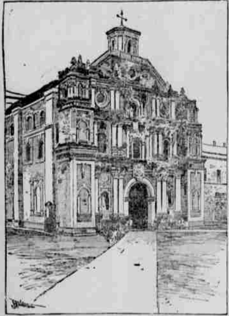
THE CATHEDRAL, THE HANSBOMERT BUILDING IN MANILA.

Manila, which may be taken as a type of all Philippine towns, can very well be called a cosmopolitan city. Its large and diversified population is made up of Spaniards, Malays, Chinese, Chinese half-breeds, Filipinos and a score of the characteristic types of the various cities of the Philippines. Together with crowded conditions and a mixture of these different people, uncleanliness, the Spaniards, officers and officials, who have gone out to the Philippines have done so principally for the sake of acquiring the most of land and property wherever fortune may be found out of the islands to form their estates in their own country. These Spaniards have not only made and made the Philippines a cosmopolitan city, but they have also brought the habits of the different nations and races to Manila.