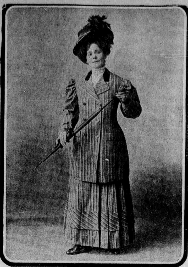
TAILORED COAT SUIT OF STRIPED BROADCLOTH.

In this season of fancy suitings striped broadcloth stands as the high-class novelty fabric. This severely tailored coat suit is developed in a striped broadcloth in shades of blue from navy to Copenhagen. Coat has two hip pockets with outside flaps and one small handkerchief pocket on the left breast. Collar is of navy blue velvet. Pleated skirt in walking length has wide band of the cloth, cut on the bias, set several inches above the hem. Small, jaunty, blue felt hat, with two shades of velvet trimming and coque pompon.