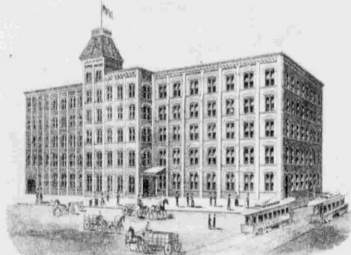
SHOE AND CLOTHING FACTORY, SALT LAKE CITY.

Our trade extends throughout the State of Utah, and into Nevada, Idaho, Wyoming, Colorado and Arizona.