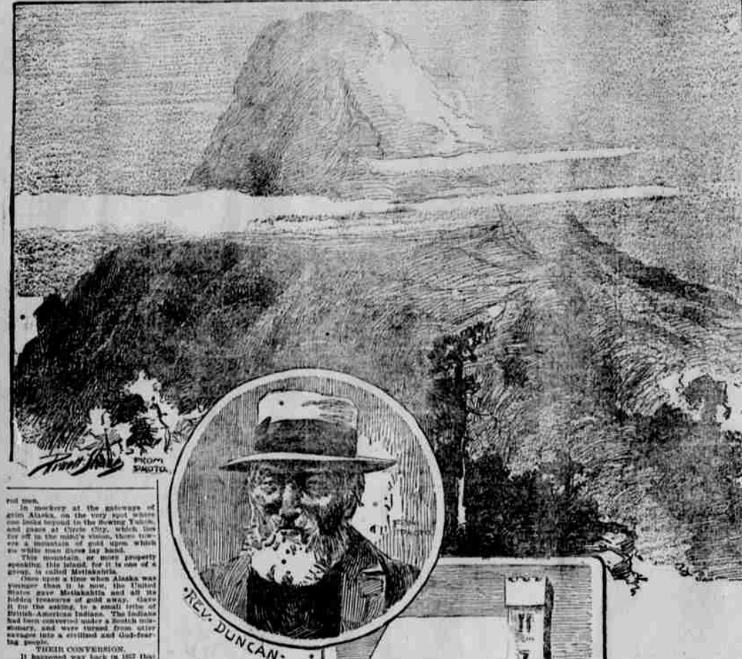
A BIRD'S-EYE VIEW OF THE ARCHIPELAGO, WHICH, ACCORDING TO THE LATEST GOVERNMENT REPORTS, IS DOTTED WITH HIGH ISLANDS.