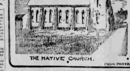
DIRECTED TO THE WORSHIP OF THE TRUE GOD BY THE CONFEDERATE INDIANS,