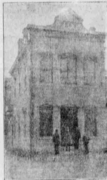
MANTI CITY SAVINGS BANK.