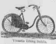
Victoria Riding Buggy.

The only way to get a Victor Pneumatic Tire is by buying a Victor Bicycle.