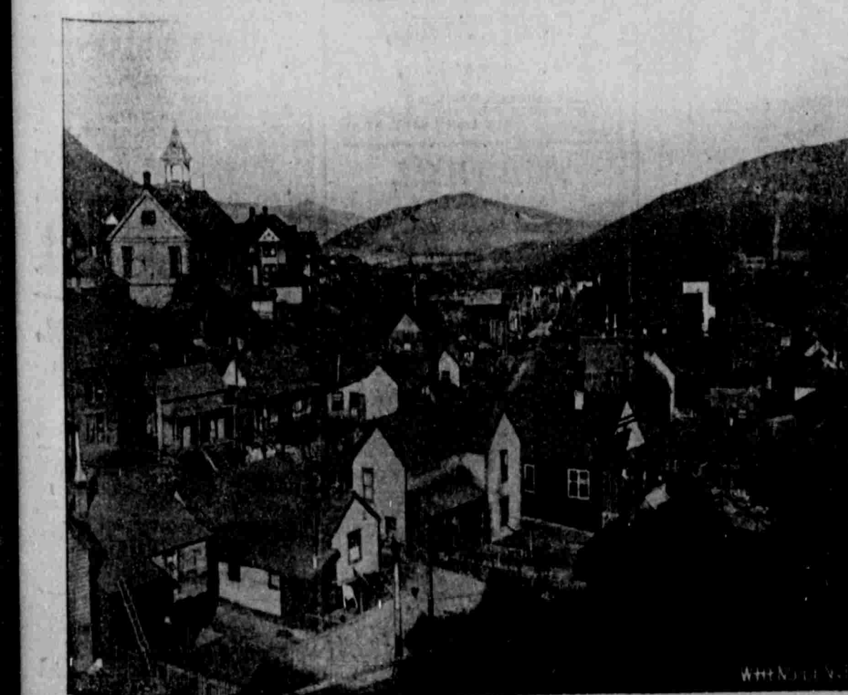
PARTIAL VIEW OF PARK CITY.