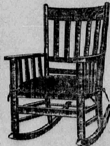
MISSION ROCKER. Prices from $25.00 to $50.00.