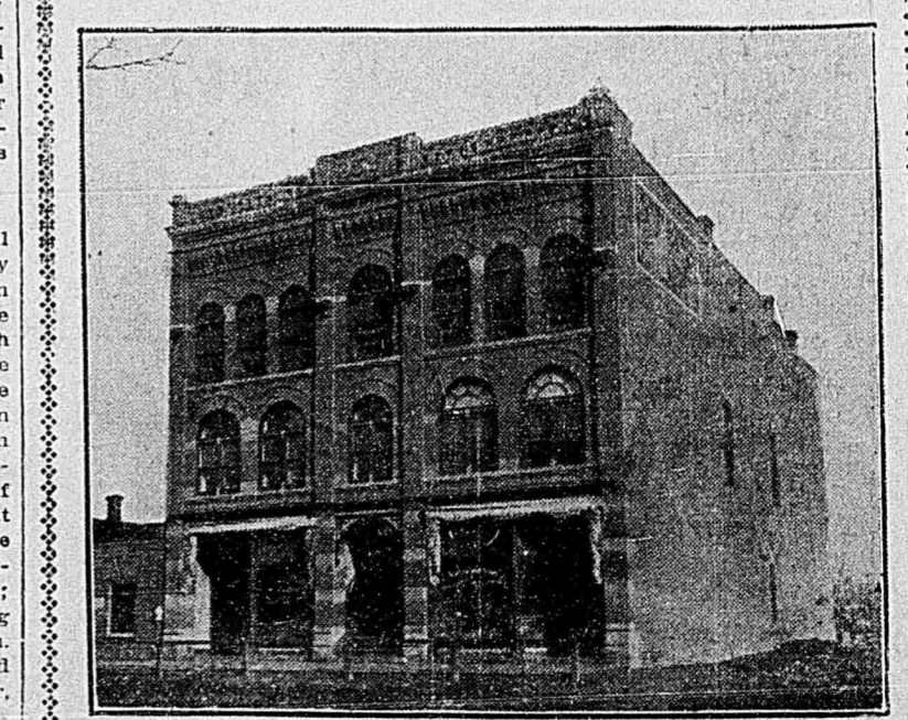
C. H. RAMPTON MERC. CO., BOUNTIFUL.

The expensiveness of our hotels keeps many Europeans of moderate means from visiting this continent (America). The other day an Englishman, who had been traveling for three years in all parts of the world, chiefly playing golf, said: "At home I am in easy circumstances; on the Continent (of Europe) I am a prince; in America I am a pauper." He meant that we are wasteful.—Canadian Courier.