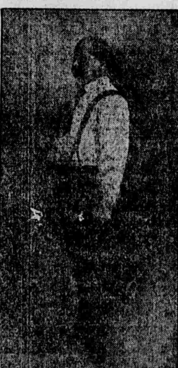
POSITIVE PROOF IN PICTURES. The Above Photographs Taken From Life, Showing the Remarkable Reduction of Flesh by Means of Kellogg's Safe Fat Reducer.

Free, positively free, a $1.00 box of Kellogg's Safe Fat Reducer, to every sufferer from fat, just to prove that it actually reduces you to normal, does it safely, and builds up your health at the same time. I want to send you without a cent of expense on your part this $1.00 package of what I am free to call a really wonderful fat reducer.