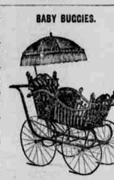
Our Prices on baby buggies range from $17.50 up to $55.00

YES The Freed Furniture and Carpet Co. does make happy Homes—because it signifies true economy, solid comfort and lasting satisfaction.