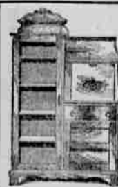
Build Oak Combination Desk like this. $10.50