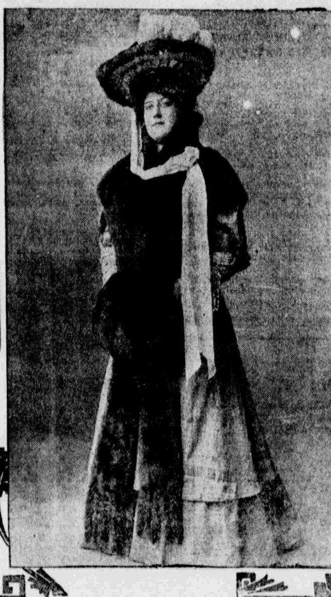
SET OF SABLE AND SABLE TRIMMED HAT.

The grand anniversary ball given by Tintle Lodge No. 311, E. P. O. E., on Wednesday evening, surpassed anything of the kind given in Eureka during the past year. The hall was beautifully decorated in purple and white and combined with the beautiful dresses of the fair sex, made a pretty picture. The full Eureka orchestra furnished