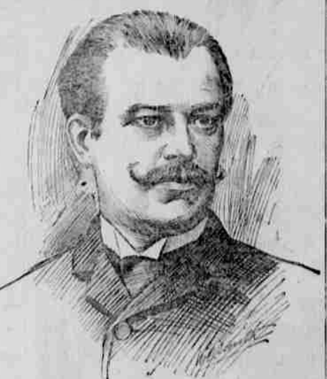
JEAN DE RESZKE.