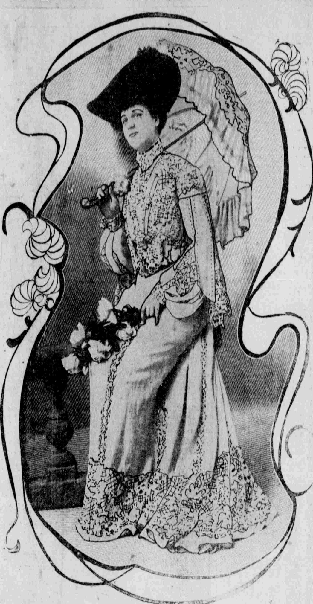
Exquisite gown of blue wool canvas over white silk slip. Seams joined by lace insertion, deep lace pleat set in above hem. Small waite of cloth and lace, with under blouse and under sleeves of white chiffon and lace. Parasol of blue silk, lace and chiffon. Large black chip hat, trimmed with black tulle, jet and feathers.