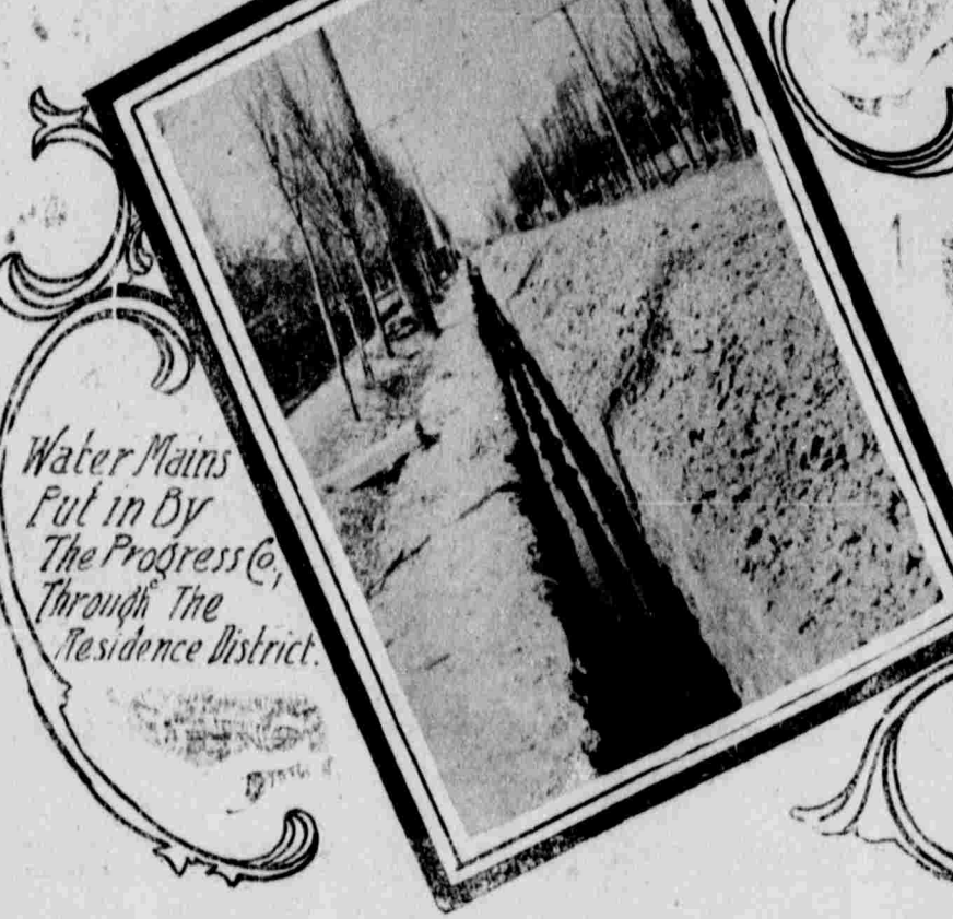
Water Mains Put in By The Progress Co. Through The Residence District