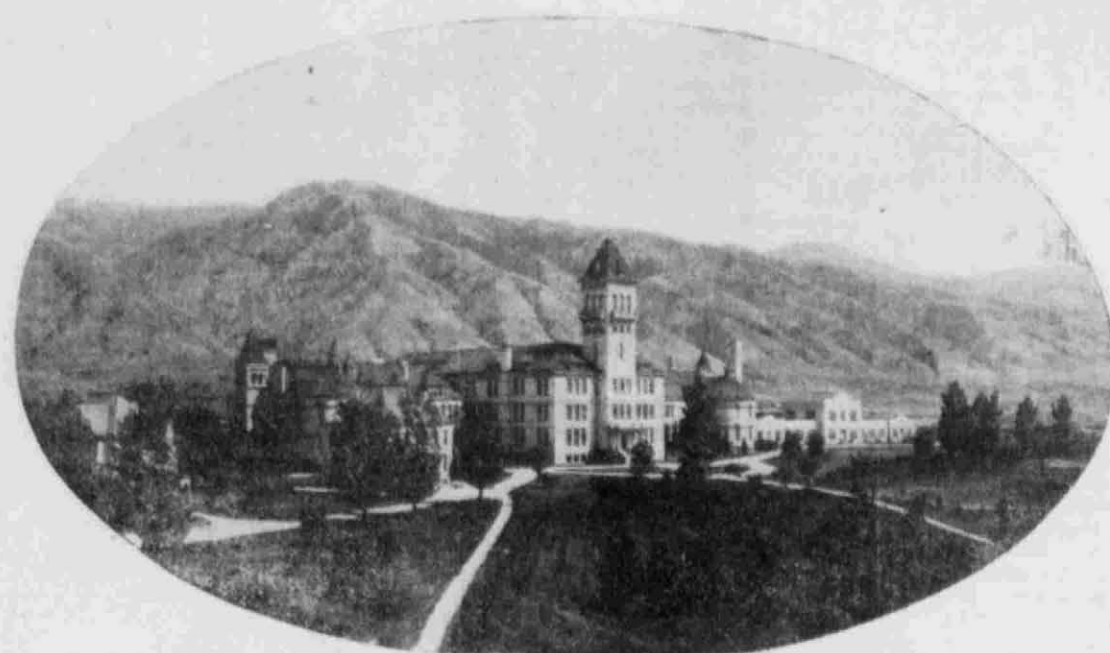
Showing Main Building, Shops and President's Cottage

These courses are all practical. You can use every item of information given. There are no educational requirements. You may work at what you choose as long as you choose during the course. Board and room can be obtained for $3.50 or $4.00 per week. In addition to the experts on the faculty, who will conduct the work, a number of men of national reputation will talk, on their respective lines, to the students. An entrance fee of $2.50 is charged; there are no other College expenses.